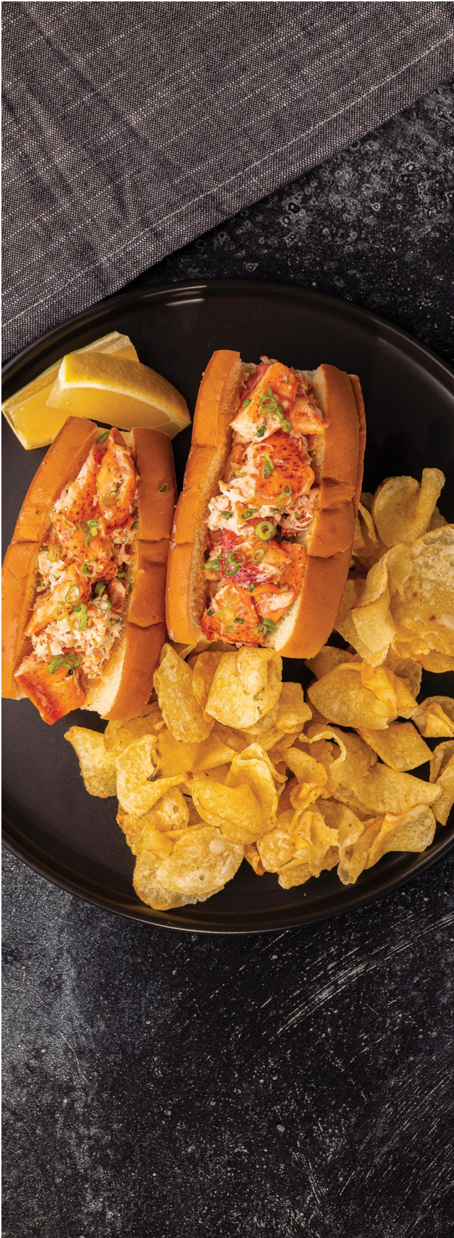
New England Lobster Roll #EFFRTE2520

Maine & Massachusetts collectively produce 93% of the total lobster harvest in the U.S.