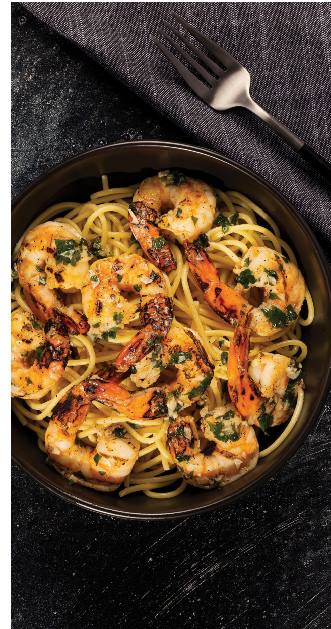
Grilled Shrimp Scampi #EZZSHR1950