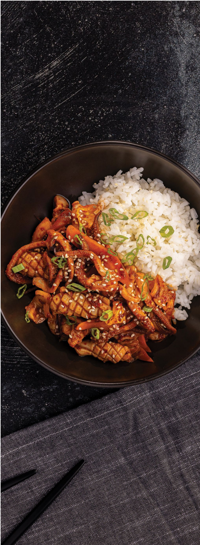
Asian-Inspired Sesame Calamari #EFFSQU1100

The word calamari originated in Italy, the name comes from the Medieval Latin noun calamarium, meaning "ink pot."