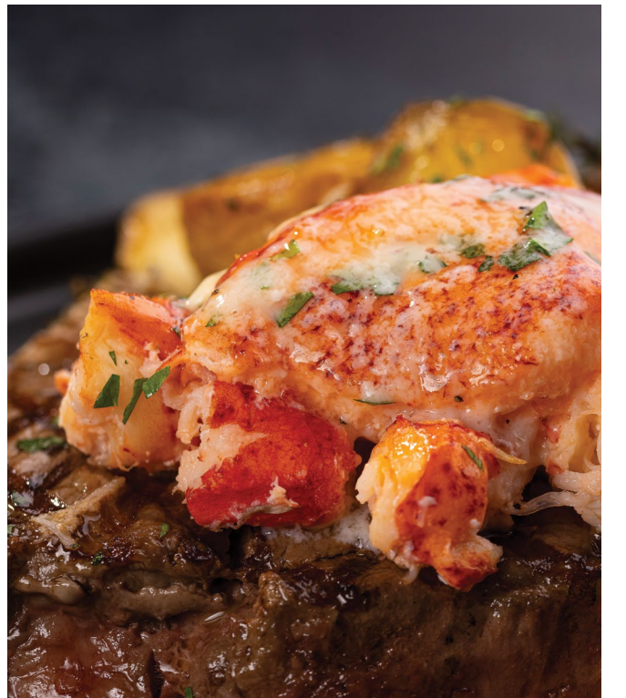
Surf & Turf NY Strip with Claw & Knuckle Meat #EZZLOB1050